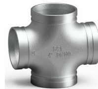
Hot dipped galvanized