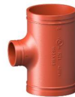
Hot dipped galvanized