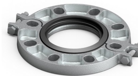
Hot dipped galvanized