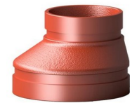
Hot dipped galvanized Orange painted