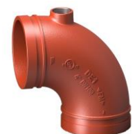
Hot dipped galvanized Orange painted