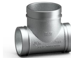
Hot dipped galvanized