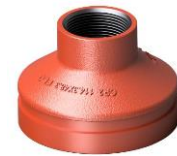
Sơn màu cam