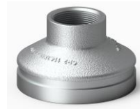
Mạ kẽm nhúng nóng