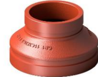
Mạ kẽm nhúng nóng